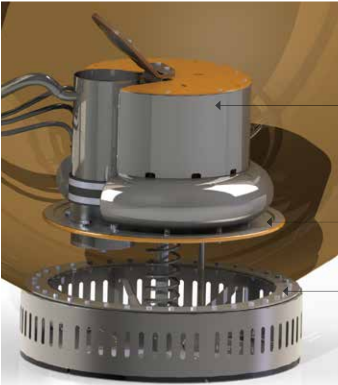
Monsoon Valve head, housing air receiver.

Bucket split load distribution is simple and precise with the Cloudburst Monsoon Valve , and its simplicity makes maintenance and field servicing simple.